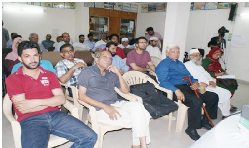
A view of the audience

Dr. Khan observed that Muslim countries also lagged behind in the collection of books in their libraries. The National Library of Malaysia had 1,300,000 volumes followed by King