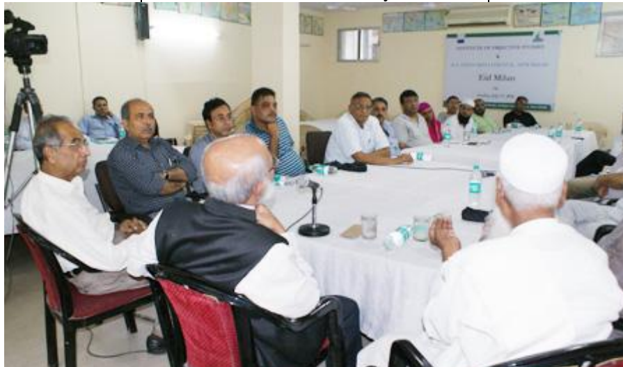
A view of the Eid Milan Programme