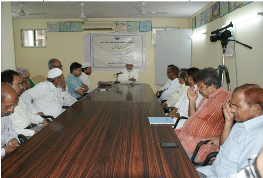
A view of the Dars-e-Quran