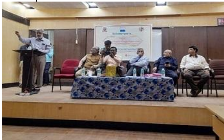
A view of the programme